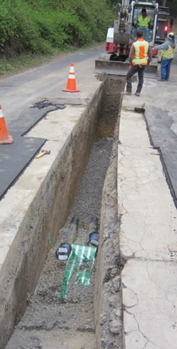
Force main replacement on Cannon Drive